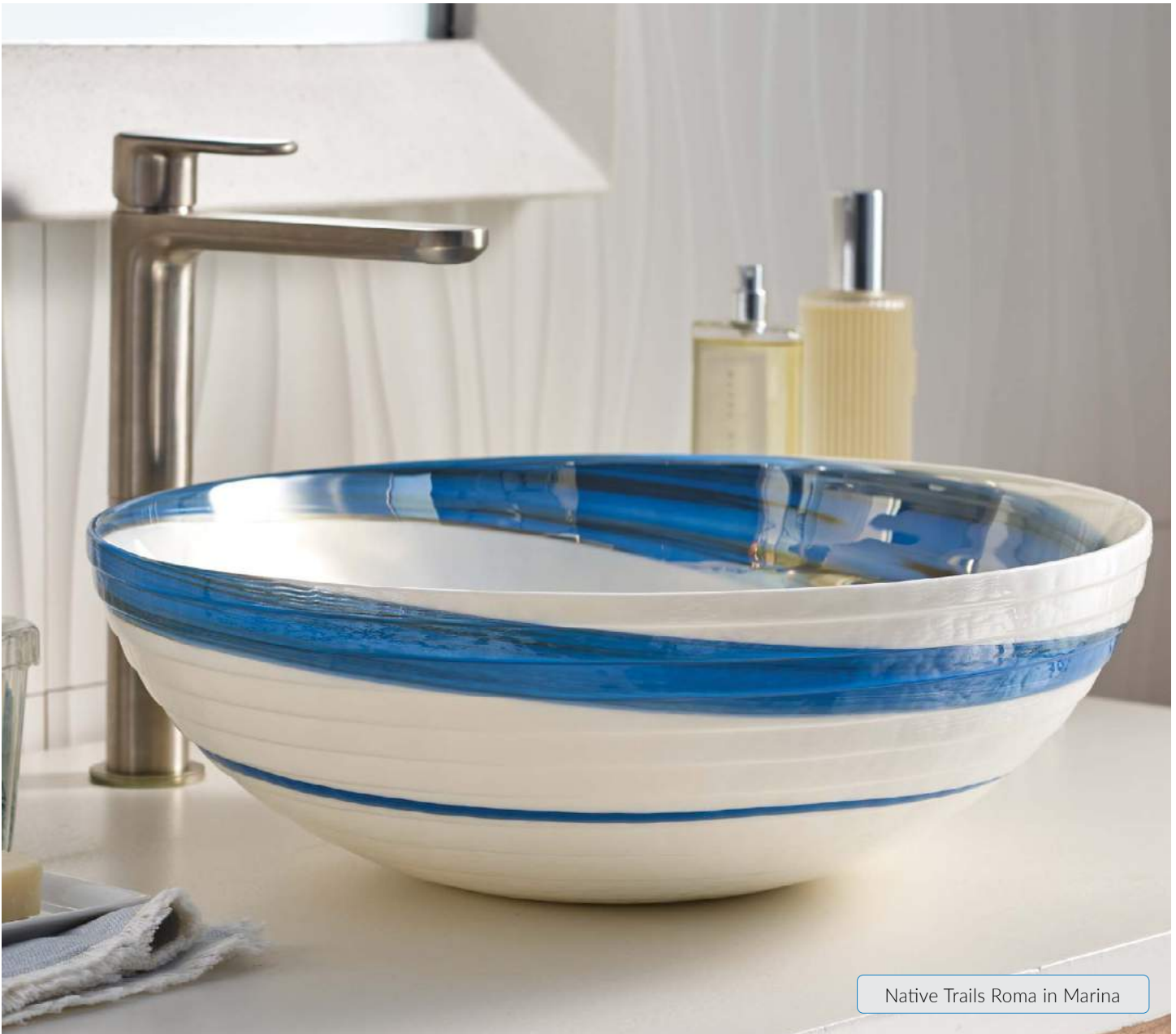
Native Trails Roma in Marina

glass vessel sink is expertly hand-formed by Italian artisans, giving each piece its own personality as an irreplaceable work of functional art. The island of Murano, just off the coast of Venice, Italy, renowned worldwide as the center of glassmaking since the 13th century, is famous for its celebrated artisan glass producers, each with their own family traditions.