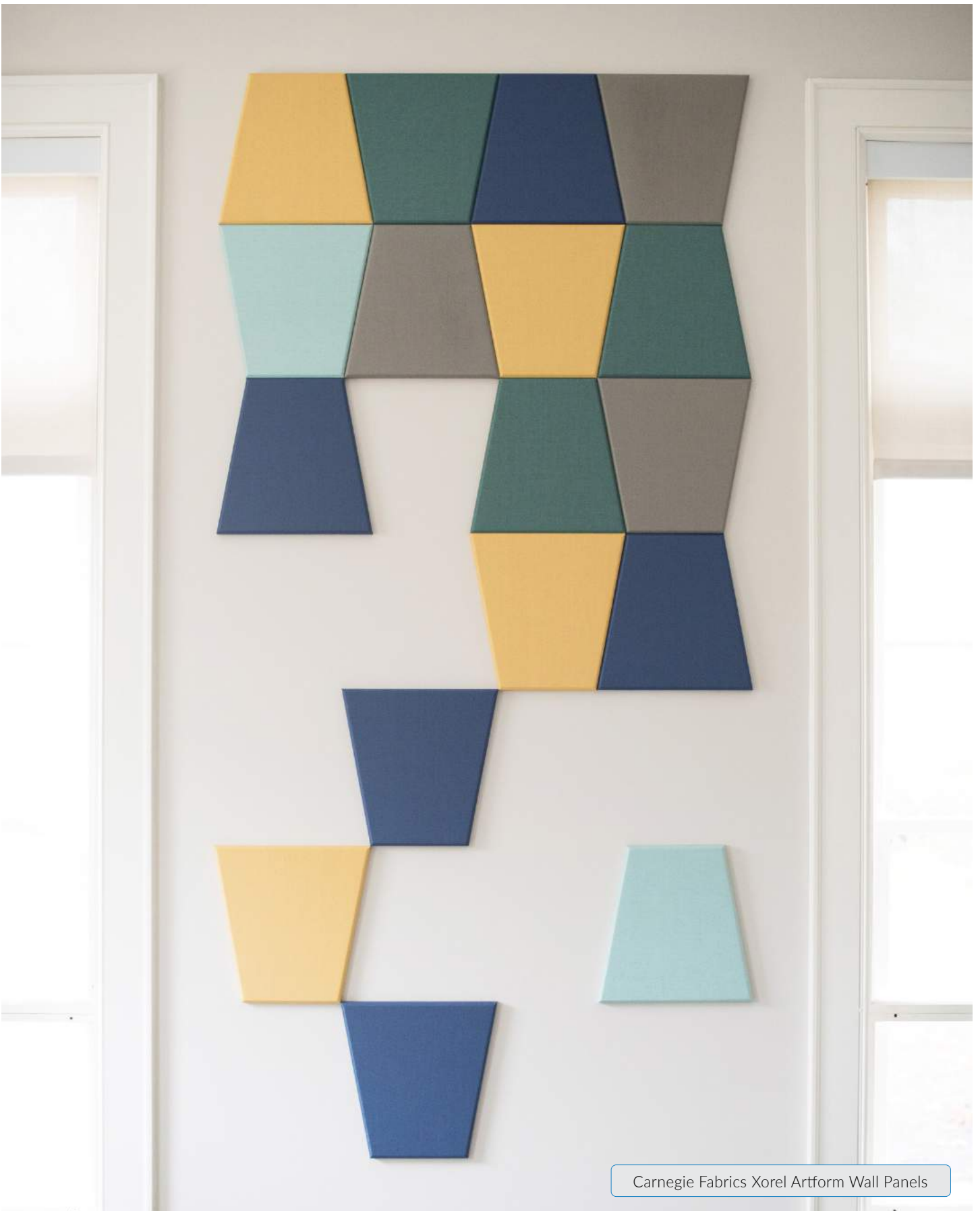
Carnegie Fabrics Xorel Artform Wall Panels