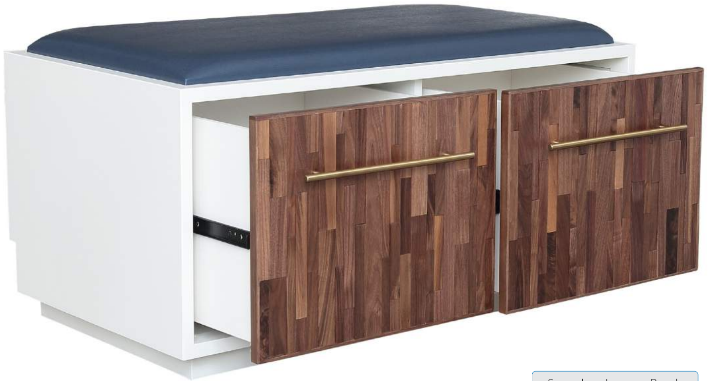
Samuelson Luggage Bench